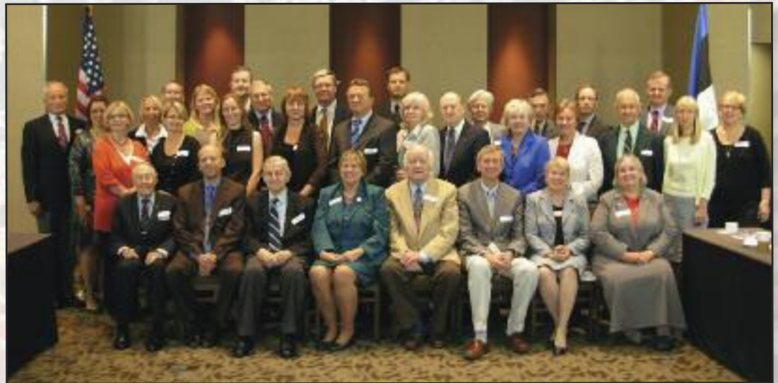
EANC elected members / ERKÜ valitud liikmed 2010

Application forms and further information are on the EANC website ( www.estosite.org ). The application form requests brief biographical information, a statement why the applicant is interested in Council membership, and a photo. Applications must be postmarked by March 20, 2014.