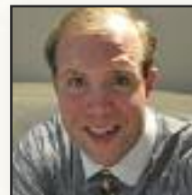
Kalev Leetaru

Leetaru has been honored as one of Foreign Policy Magazine's top 100 Global Thinkers of 2013, a prestigious award which recognizes "the world's most exciting people... A master of 'big data,' Leetaru uses high-powered algorithms to analyze vast quantities of news reports and other publicly available intelligence, enabling him to see previously hidden patterns in economic and political developments."