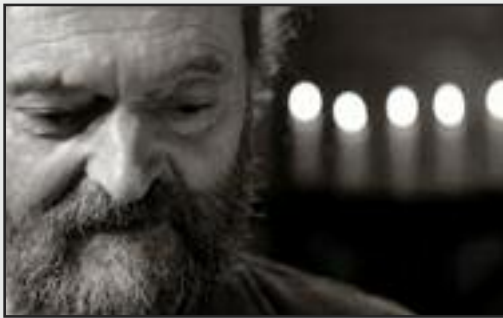
Arvo Pärt Project May – June 2014